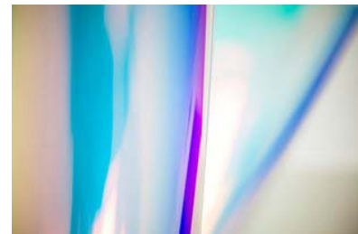
3M™ Dichroic - Chill