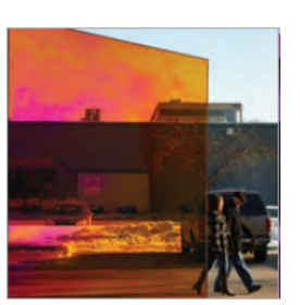
Chill Product: Blue/Magenta/Yellow in transmission at various angles