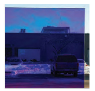
Blaze Product: Cyan/Blue/Magenta in transmission at various angles