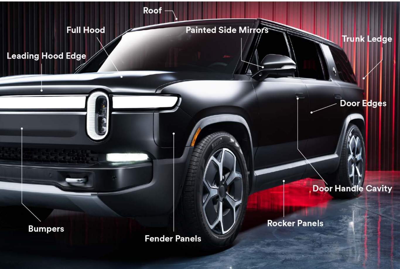
Applications shown above indicate typical areas of placement on personal vehicles. Actual film placement will vary according to the needs of the customer.